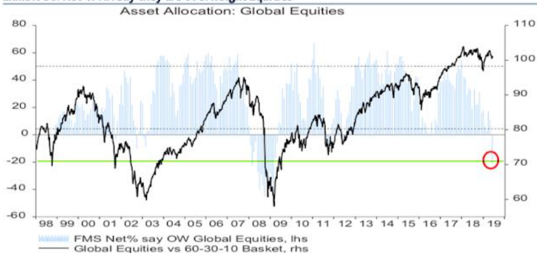
Exhibit 30: Net % AA Say they are overweight Equities

Source: BofA Merrill Lynch Global Fund Manager Survey