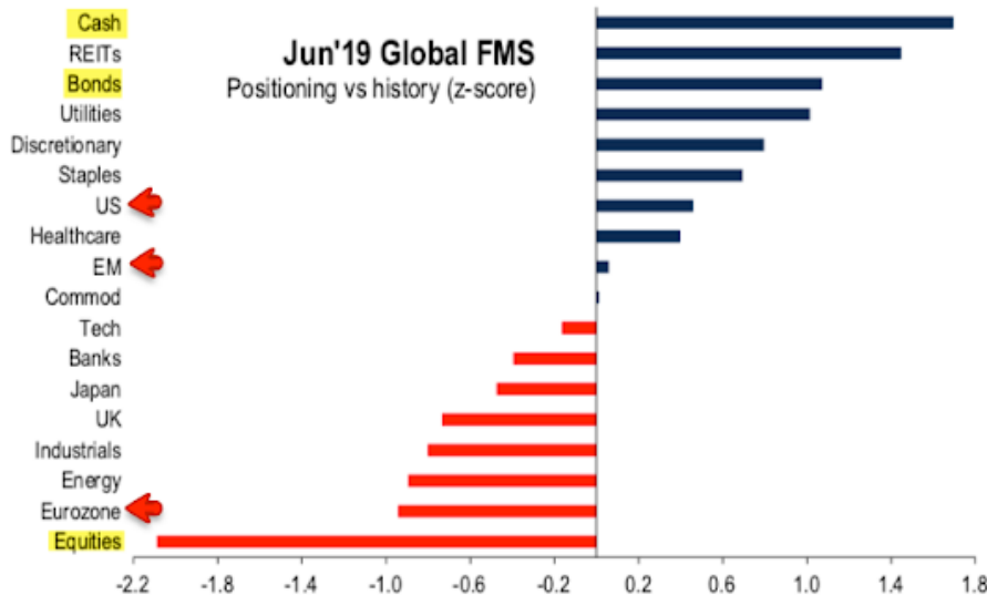
Exhibit 8: FMS investors positioned for low growth & low rates

Source: BofA Merrill Lynch Global Fund Manager Survey